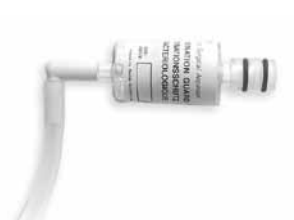
C0005 Contamination Guard