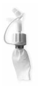
CV260438000 Specimen Trap