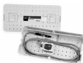
C2623 / C2636 Sterilization Case