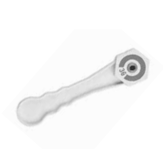
C5601 / C5602 Sterile Torque Wrench