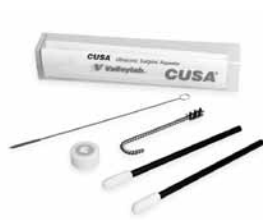
C0023 Extended Life Tip Maintenance Kit