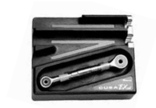
C5600 Tip Torquing Set