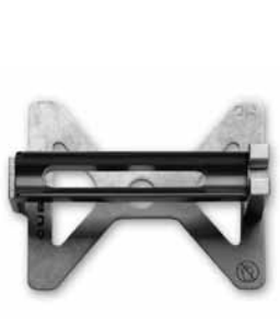
C5623 / C5636 Sterilizable Torque Base